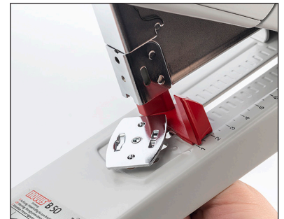
Bypass System- Rotate the anvil to prevent longer staple legs from overlapping.