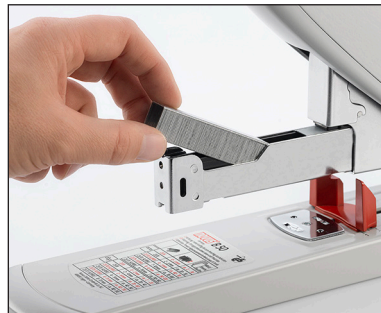
Dual staple guide system provides even pressure on the staple legs to prevent jams.